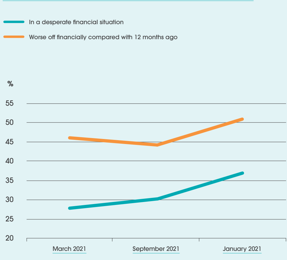
Figure 3. A rise in financial hardship. Peabody resident survey, March 2021 – January 2022