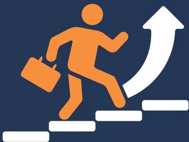
Supporting career development

Local labour market information can be hard to access or relate to