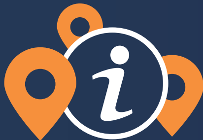
Providing local employment information

The Workwise programme, led by Aberdeen City Council in partnership with Aberdeenshire Council and North East Scotland College (NESCol), aims to support adults in the local area to move closer to work by: